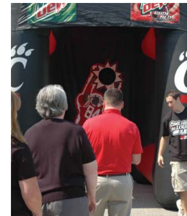
The Bearcat Caravan put armchair quarterbacks to the test at the Center's last quarterly training and networking session in September.

Further, the center has developed a new program, held four times a year, combining training and open house to generate business-to-business networking.